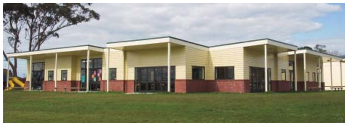
A 4-classroom block at Hobsonville Primary

When Hobsonville Primary School engaged an architect and put the design for their new classroom block out for tender none of the bids met their budget.