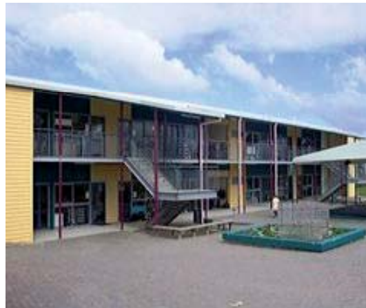
Gulf Harbour School in Auckland

Over the last 6 years they have completed more than 50 design build projects for schools. Everything from simple classroom blocks to complete new schools and the full spectrum in between - administration buildings, libraries and IT suites, halls, gymnasiums and auditoriums; they handle the total project including site works and landscaping.