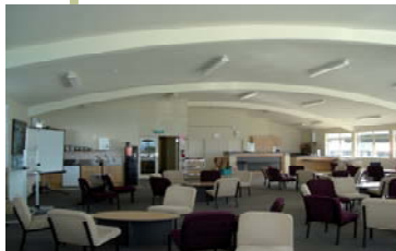
A new staff room is part of the state-of-the-art administration complex

Following the success of the gymnasium project, the school had no hesitation in engaging Econo Built to replace its outdated administration building.