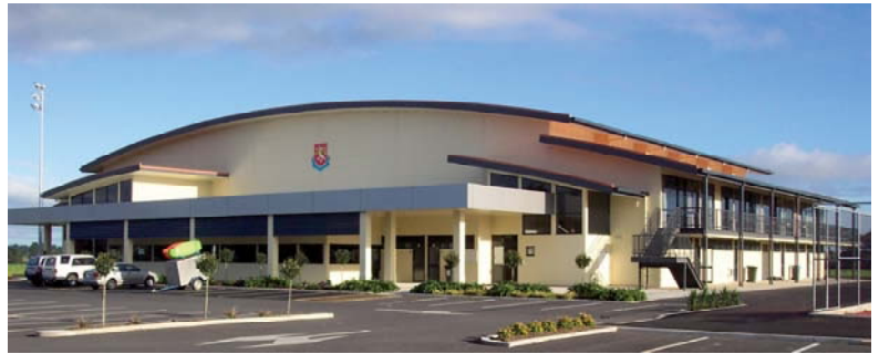
New gymnasium/events centre at St Peters School, Cambridge

St Peter's is one of the leading independent, co-educational secondary schools in New Zealand. Situated on 100 acres of park-like grounds near Cambridge, the school currently has 1083 students including 430 boarders.