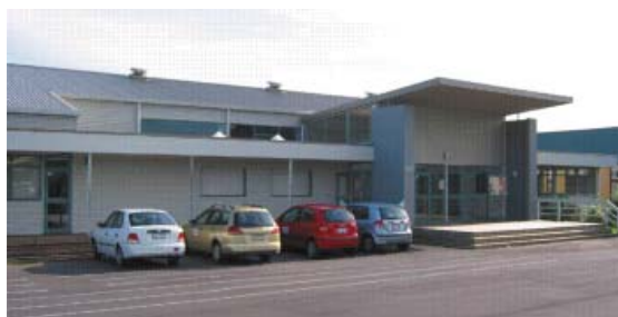
New School and Community Hall at St John the Evangelist School in Otara

After viewing other halls built by Econo Built and evaluating the design build process, the Catholic Schools Office approved the design build process and chose Econo Built Design Build Ltd.