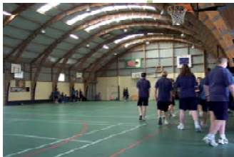
The gymnasium is still in great shape 11 years on

Some six months later the new state of the art administration complex was completed, on time and within budget. The staff room, with its extensive views of the Hauraki Gulf, is a truly outstanding facility.